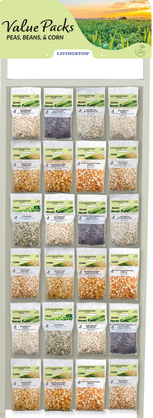
Fixture: 1PB24 shipped separately